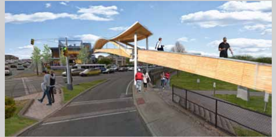
NOLENSVILLE PIKE AND THOMPSON LANE ENVISIONED WITH PEDESTRIAN BRIDGE AND STREETSCAPING