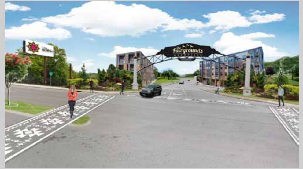
NOLENSVILLE PIKE ENTRANCE TO FAIRGROUNDS