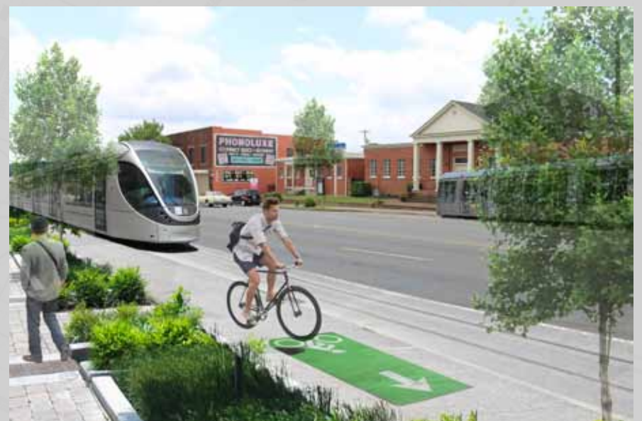
NOLENSVILLE PIKE IN THE FLATROCK AREA ENVISIONED WITH LIGHT RAIL AND COMPLETE STREETS