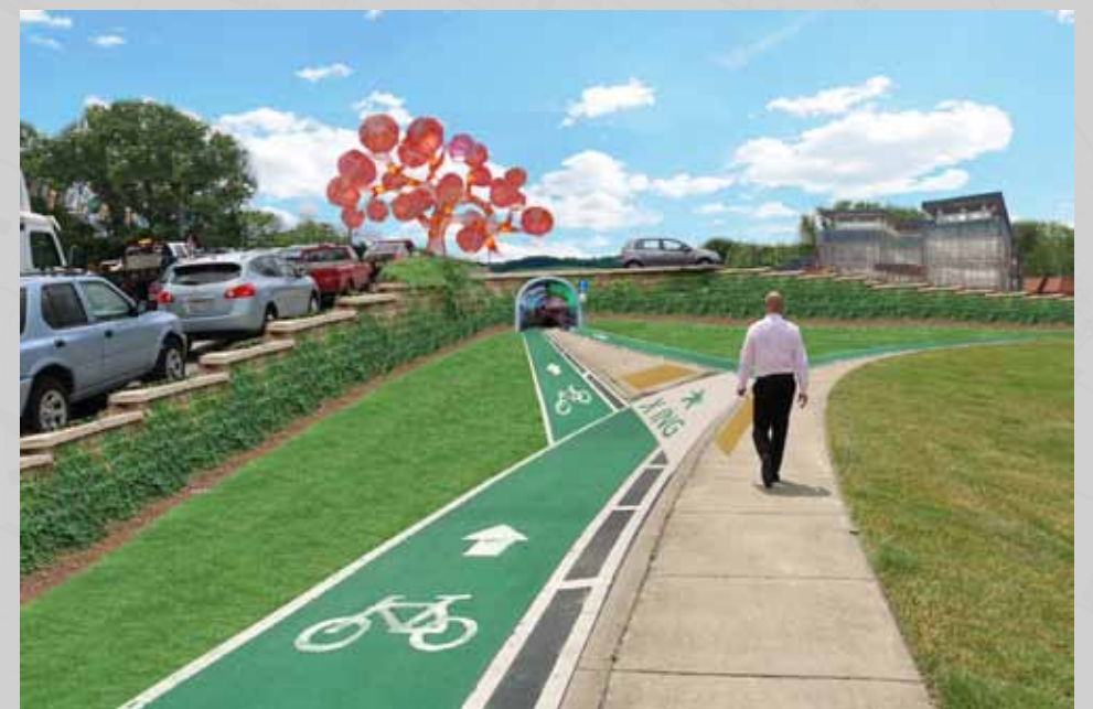
NOLENSVILLE PIKE & HARDING PLACE INTERSECTION ENVISIONED AS A ROUNDABOUT