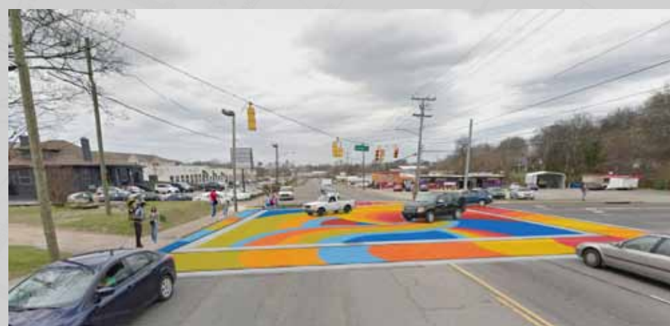
NOLENSVILLE PIKE AND GLENROSE AVE BY CASA AZAFRÁN