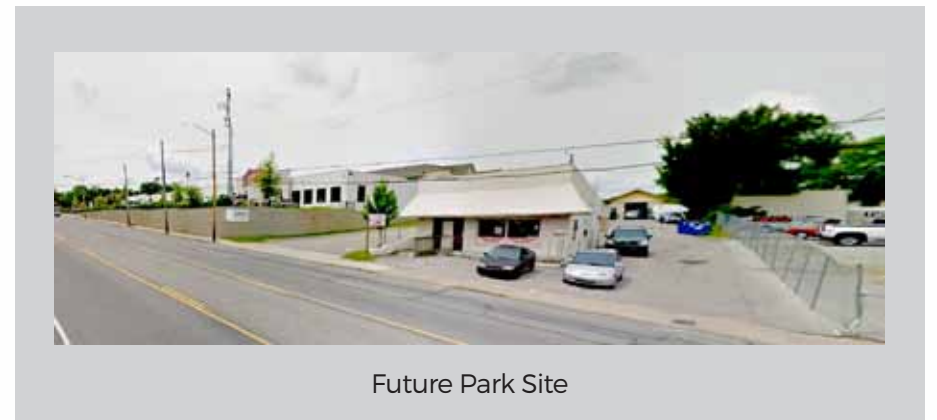
Future Park Site

Conexión Américas is partnering with the Mayor's Office and Metro Parks to create a public park next to Casa Azafrán. The community center hosts more than 10,000 visitors per year, primarily families with young children. "Where's the playground?" is one of the most common questions heard from families who wish to linger in the inviting surroundings after an English class or a visit to the doctor or financial counselor. The need for open green space --and a playground-- nearby became even more urgent in 2014 with the opening of Metro Nashville Public Schools' Casa Azafrán Early Learning Center, which serves 100 young children five days a week.