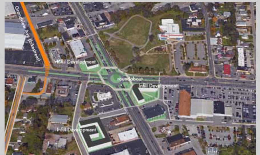
NOLENSVILLE PIKE AND THOMPSON LANE ENVISIONED WITH BIKE STREET, STREETSCAPING, CROSSWALKS, ROUNDABOUT, AND INFILL DEVELOPMENT