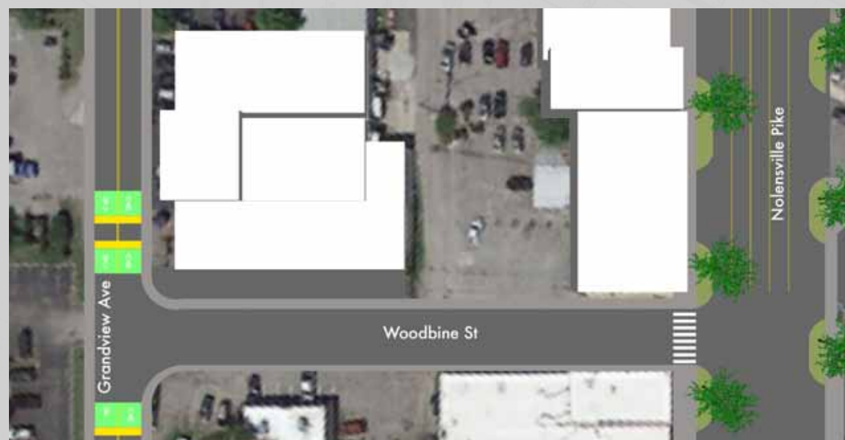
GRANDVIEW ENVISIONED AS A BIKE STREET, WOODBINE ENVISIONED WITH SIDEWALKS, NOLENSVILLE WITH STREET TREES AND IMPROVED SIDEWALKS