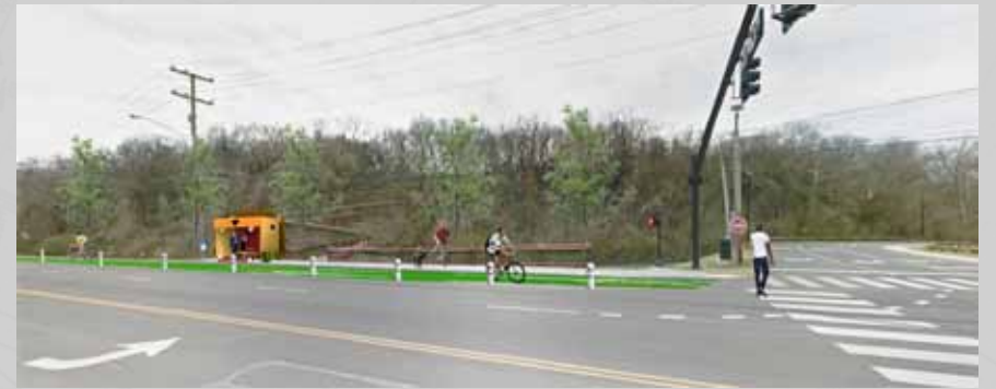
ENTRANCE TO ZOO ON NOLENSVILLE PIKE WITH BIKE LANES, FUN BUS SHELTER, WALKWAY TO CROFT MIDDLE DESIGN CENTER, AND STREETSCAPING