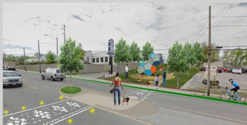
MID-BLOCK CROSSING TO FUTURE CASA AZAFRÁN PARK