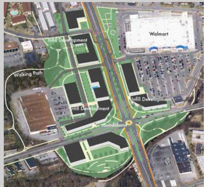
NOLENSVILLE PIKE AND HARDING PLACE INTERSECTION RE-ENVISIONED AS A ROUNDABOUT WITH INFILL SUGGESTIONS