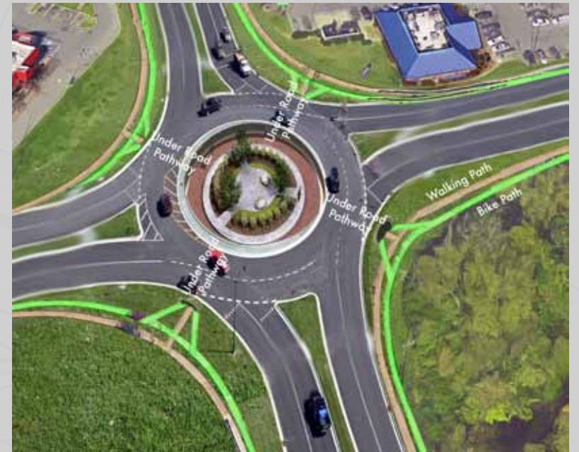
NOLENSVILLE PIKE AND HARDING PLACE INTERSECTION ENVISIONED AS A ROUNDABOUT (pedestrians and cyclists use under road paths)