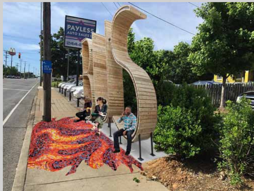
ART BUS STOP AT CASA AZAFRÁN