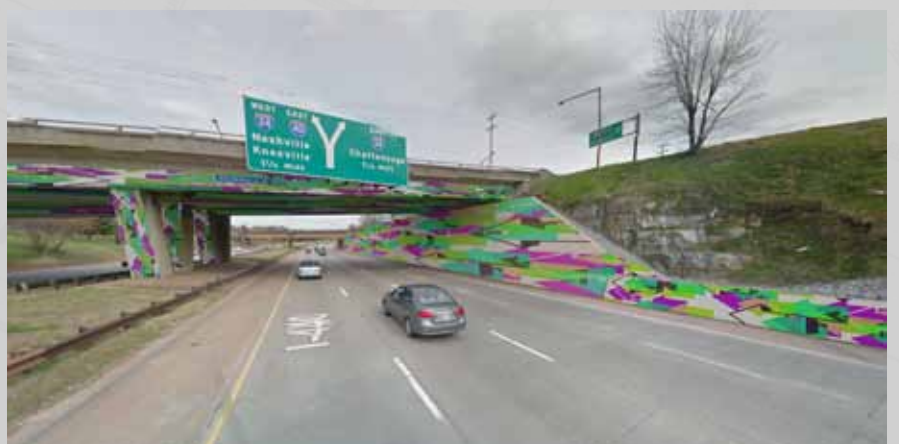
NOLENSVILLE PIKE AND I-440 ENVISIONED WITH UNDERPASS MURAL