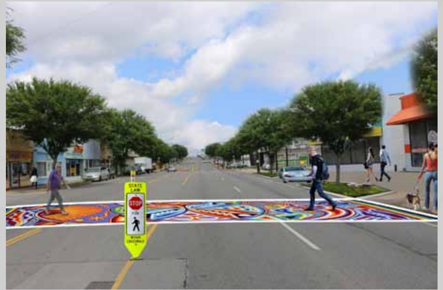
MID-BLOCK CROSSING ON NOLENSVILLE PIKE BY WOODBINE HISTORIC AREA