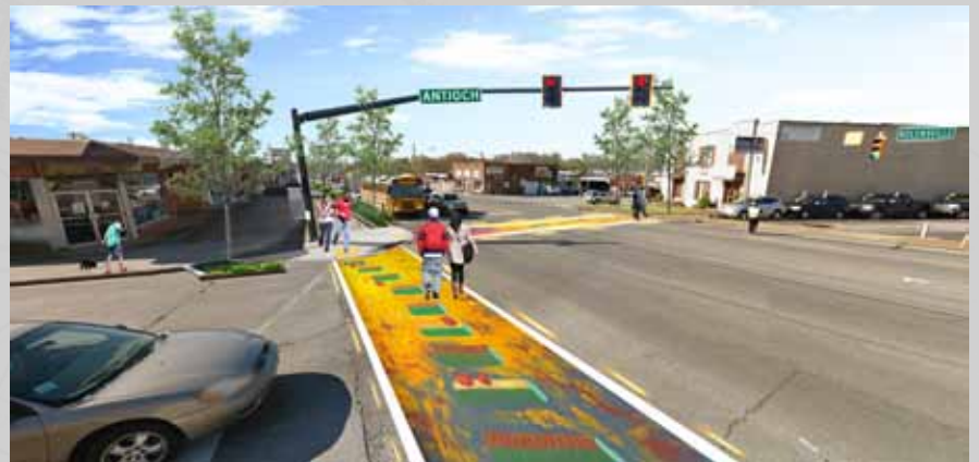
NOLENSVILLE PIKE AND ANTIOCH ENVISIONED WITH ART CROSSWALKS AND COMPLETE STREETS