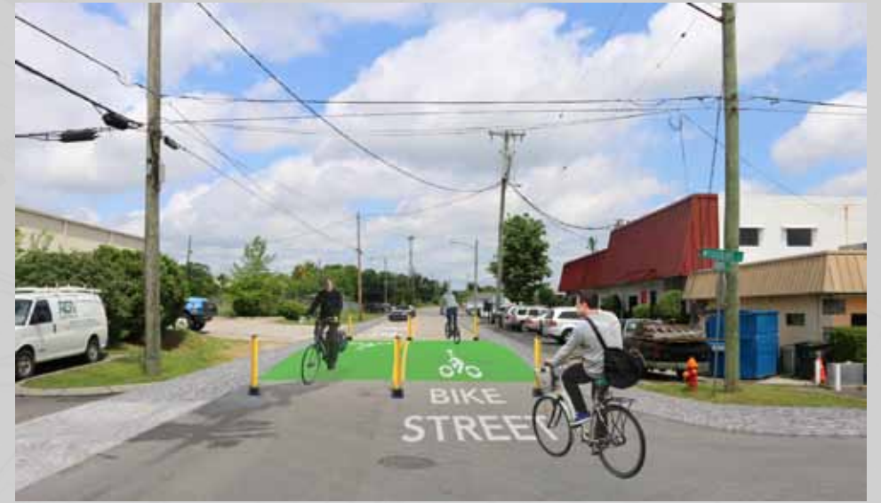
GRANDVIEW AVE BIKE STREET