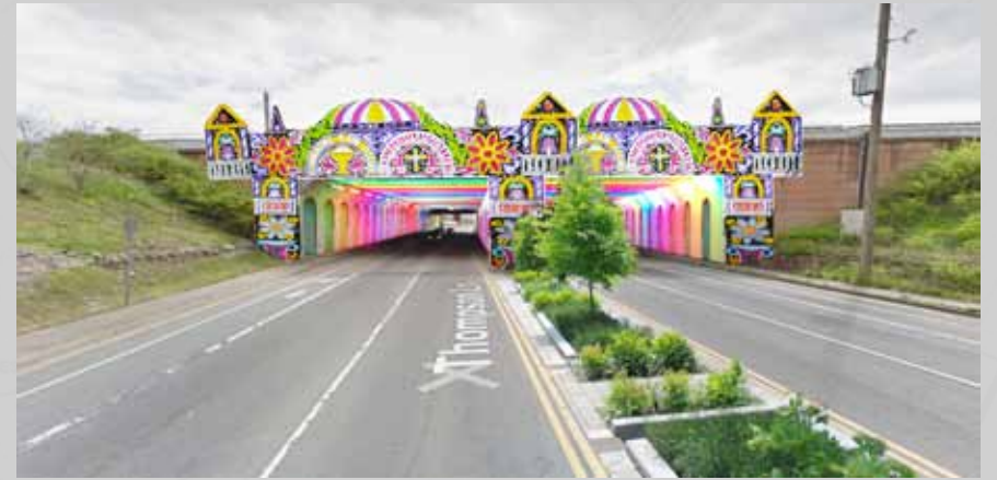
ENTRANCE TO NOLENSVILLE PIKE FROM THOMPSON LANE