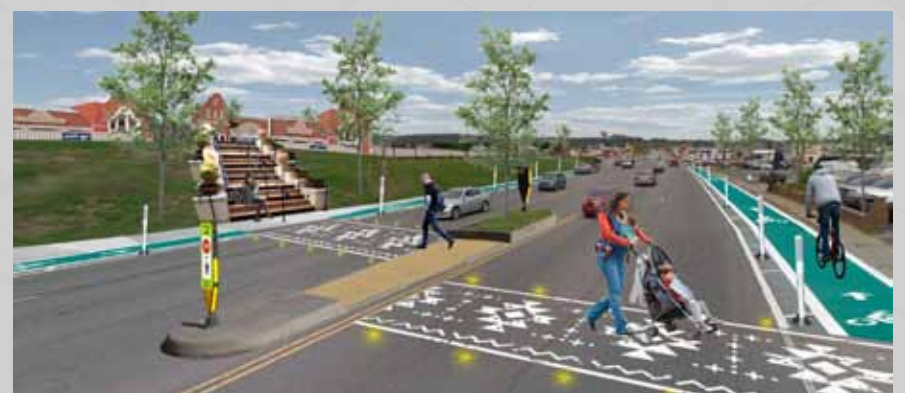
MID-BLOCK CROSSING ON NOLENSVILLE PIKE BY PLAZA MARIACHI