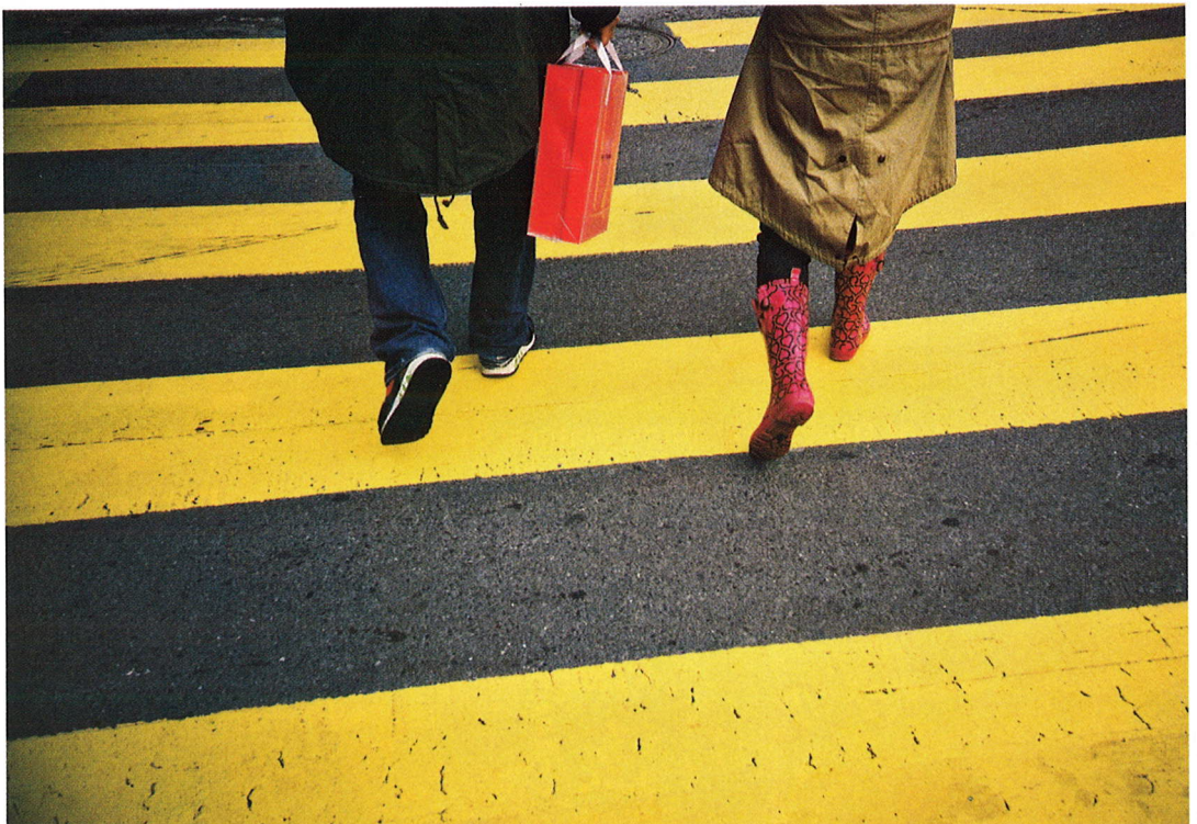
Cities with the highest risk of fatality to pedestrians often lack sufficient sidewalks and crosswalks.