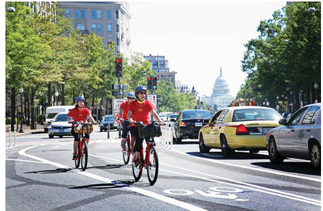
Washington, DC used CMAQ funds (in part) to help launch Capital Bikeshare, providing a transportation option other than solo driving for short trips.

congestion and transportation emissions as well as a description of progress towards goals and projects to achieve those goals. These plans must be updated every 2 years.