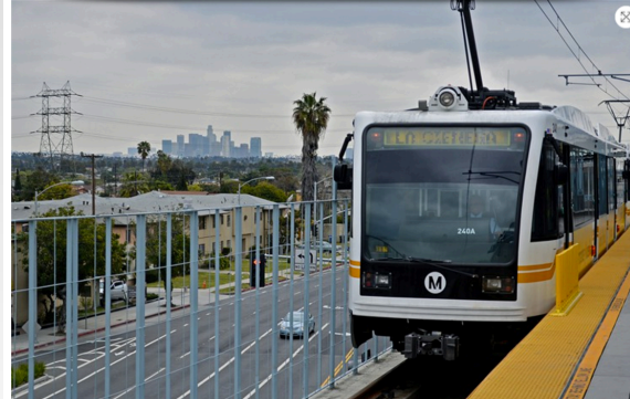
The Expo Line pulls into the La Cienega station.

WEDNESDAY, NOVEMBER 9, 2016 AT 8:08 A.M.