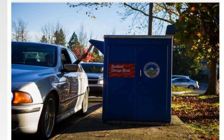
FILE - A voter casts his ballot at the drive-up drop box by Tigard City Hall on Nov. 8.